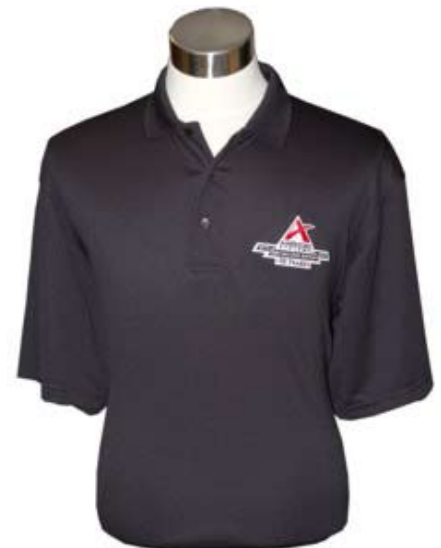
35th Anniversary Bamboo Dryfit Polo $31.25