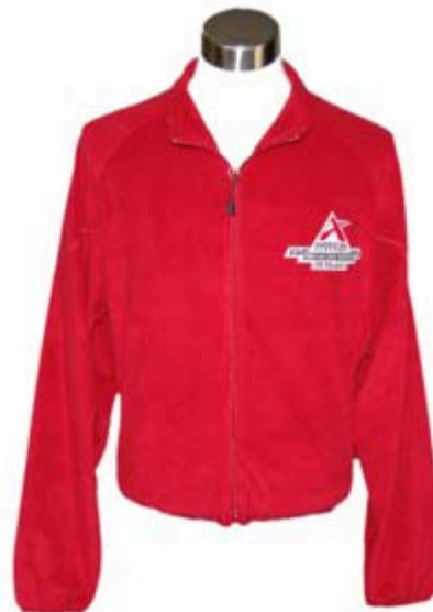
35th Anniversary Lightweight Jacket $40.50