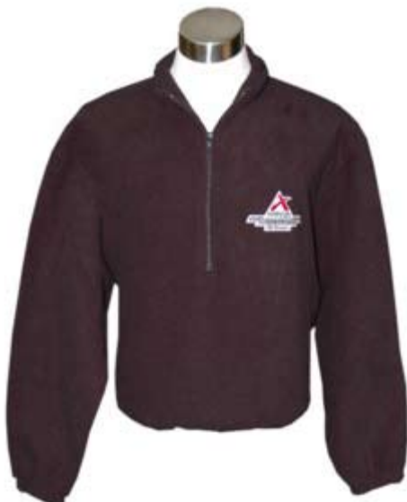
35th Anniversary 1/4-Zip Fleece $35.00